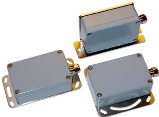
Fixing plates from stainless steel for sensor boxes